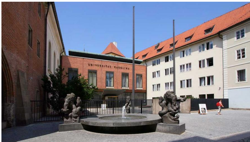
Entrance to the Karolinum from Ovocný Trh